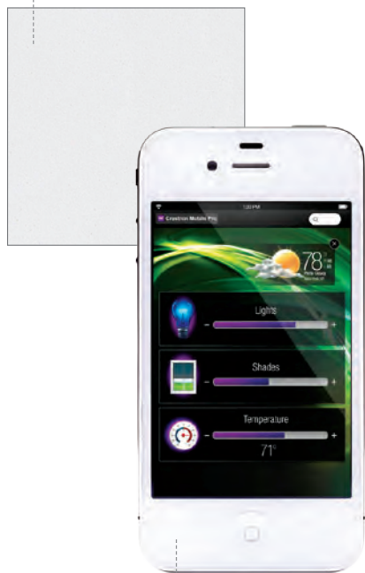
Crestron Thanks to Crestron's home-integration system, the shades and stereo system in the living room can be controlled from any mobile device; crestron.com .