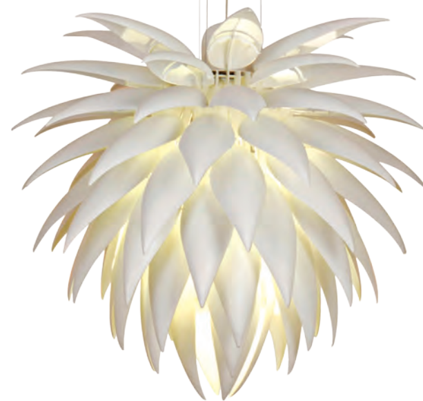
Possini Euro Design Icicle Leaf Chandelier Christopher Kennedy lit up the living room with this dramatic chandelier from Lamps Plus; lampsplus.com .

Beginning January 7 Purchase even more of the furnishings and accessories from CH+D's Small Space Big Style showhouse on OneKingsLane.com .