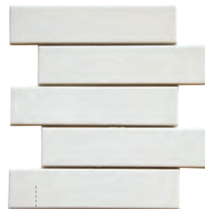
Glossy White Porcelain Mosaic Tile The pure white tiles from WalkOn Tile were paired with a black matte option in Christian May's high-contrast mezzanine powder room; walkontile.com .